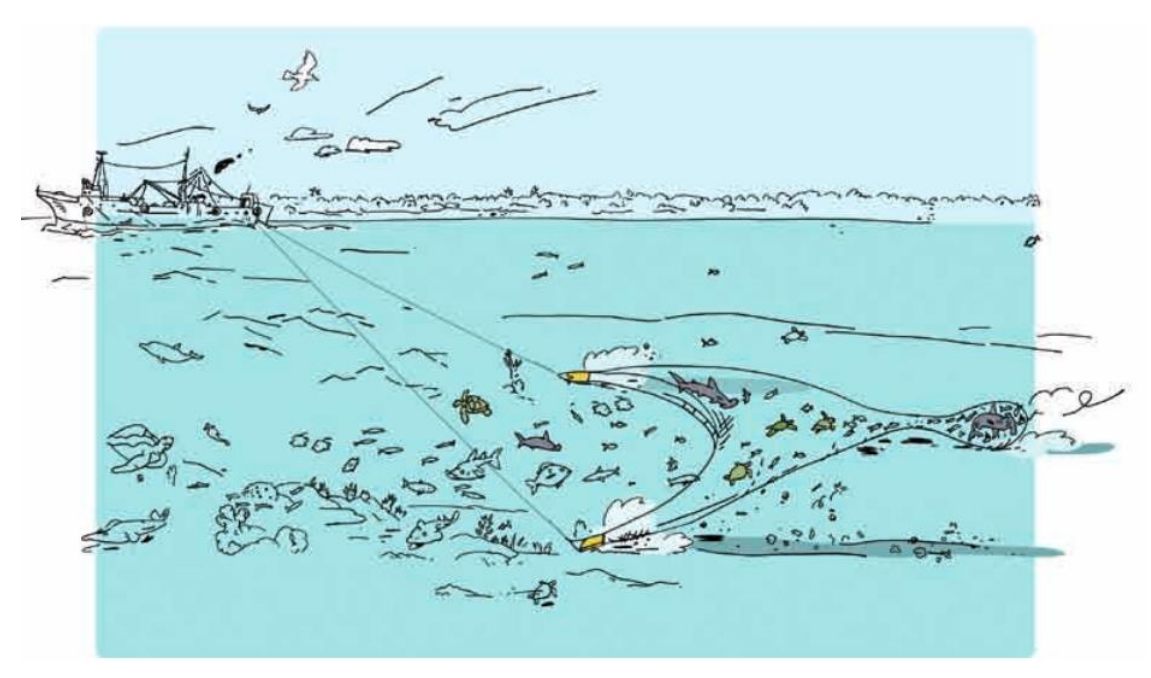
Figure 2: Illustration of bottom trawl

Globally, losses due to IUU or "pirate fishing" are estimated to be between US$10 billion and US$23.5 billion per year. West African waters are estimated to have the highest levels of IUU fishing in the world, representing up to 37 percent of the region's catch. Along with the economic losses, pirate fishing in West Africa severely compromises the food security and livelihoods of coastal communities. IUU vessels compromise the health of fish stocks and the marine environment.