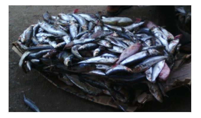
Sardinella spp. (Sardines)