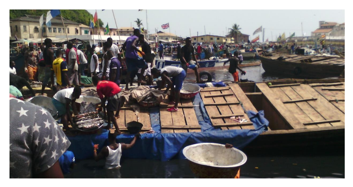
Plate 1: A retrofitted fish transhipment (Saiko) canoe

Addressing Illegal Fishing through Education and Sensitization for Sustainable Fisheries Management in Ghana: Research Report