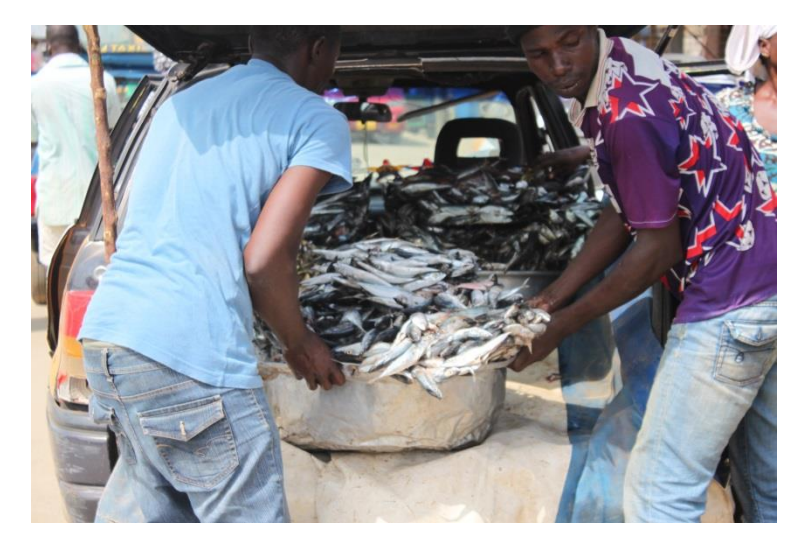
Plate 3: Saiko fish being loaded into a taxi cab for transport from Apam

A slab of fish (averagely, 11 kg) is sold at GHC 26 - 30 to the fishmongers depending on the commercial value of fish species constituting the slab. Those who sell unprocessed saiko fish make roughly profit of GHC 2 - 10 on each slab sold while those who smoke make between GHC 10 and 20 on each slab.