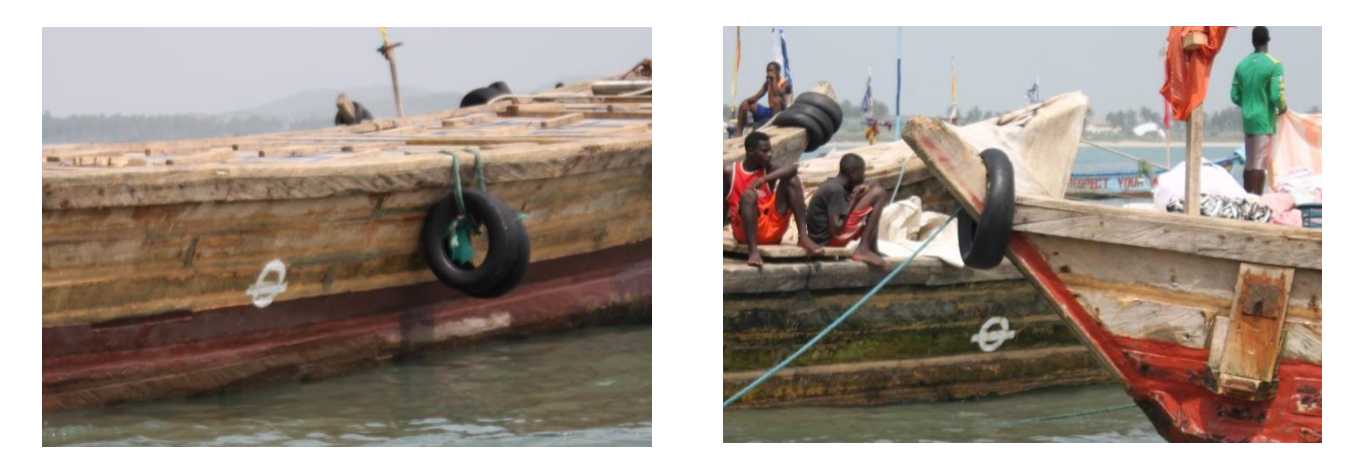
Plate 2: Fish transhipment (Saiko) canoe showing the registration symbol in white paint