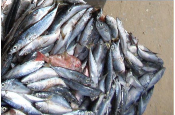
Trachurustrachurus (Horse mackerel)