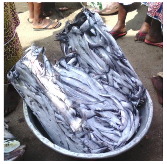
Trichiuruslepturus (Large hair-tail cutlass fish)

Appendix 1: Various species transhipped in the Saiko fishery