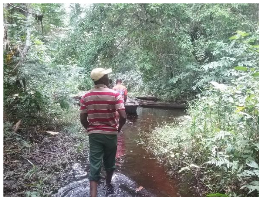
A swamp forest at Ebonloa