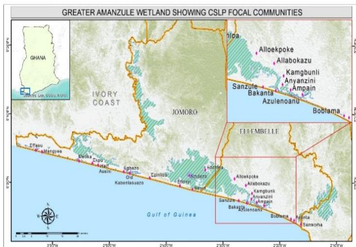
Greater Amanzule Wetland showing CSLP Focal Communities

The Greater Amanzule Wetlands (GAW) covers approximately 50,000 hectares of land stretching from the Ankobra Estuary in the Nzema East and the Ellebelle districts in Ghana, to the Tanoe-Ehy marsh at the Ivory Coast border. The GAW is rich in biodiversity and supports numerous livelihood activities. Over 50 communities comprising more than 7,000 farming and fishing families depend directly on the GAW resources for food, fuel-wood, fish, shell fish and drinking water. Recent flora and fauna surveys conducted by the Wildlife Division of the Forestry Commission recorded over 59 plant species with more than 59 percent covering peat swamps and mangrove forests. The faunal surveys identified 40 mammal species, 78 bird species and 17 amphibian and reptile species. The beaches connected to the GAW also present suitable sites for nesting of sea turtles.