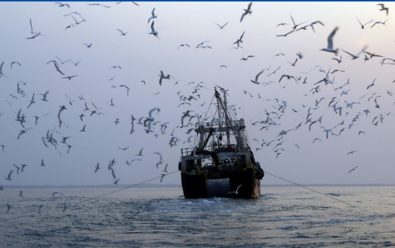
Saiko accrues profits to a handful of owners of industrial trawlers and saiko canoes, to the detriment of millions across Ghana's coastline. In 2017, around 80 industrial trawlers were licensed to fish in Ghana's waters.

The Environmental Justice Foundation (EJF) and Hen Mpoano are working in partnership under the Far Dwuma Nkodo – “Securing Sustainable Fisheries” project, with financial support from the European Union and the German Federal Ministry for Economic Cooperation and Development (BMZ) . The Far Dwuma Nkodo project is a three-year project to secure greater environmental sustainability and social equity in Ghana's fishery sector.