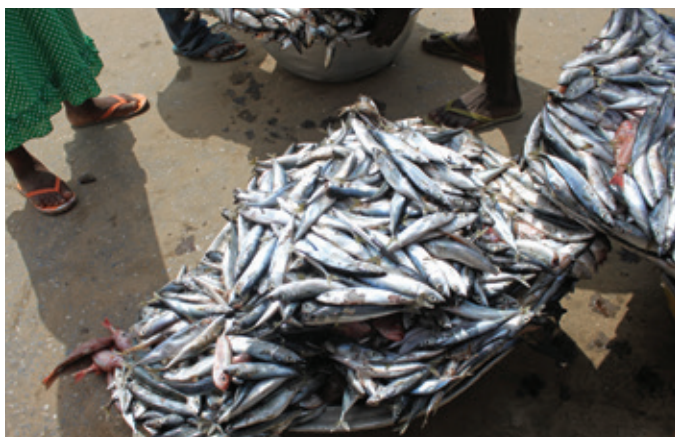
An average saiko trip lands 26 tonnes of fish.