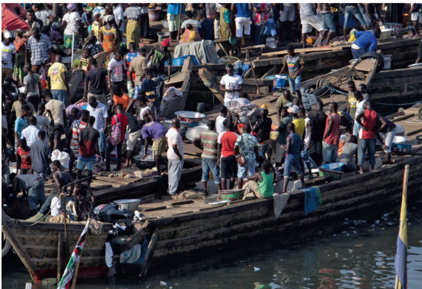
Despite being illegal, a low risk of arrest and sanction has meant that saiko landings have taken place in full view of authorities.