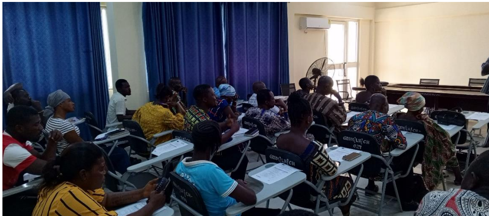
Figure 3: A cross-section of the participants during the presentation

indivisibility, and interdependence, were explored through interactive discussions and real-life examples.