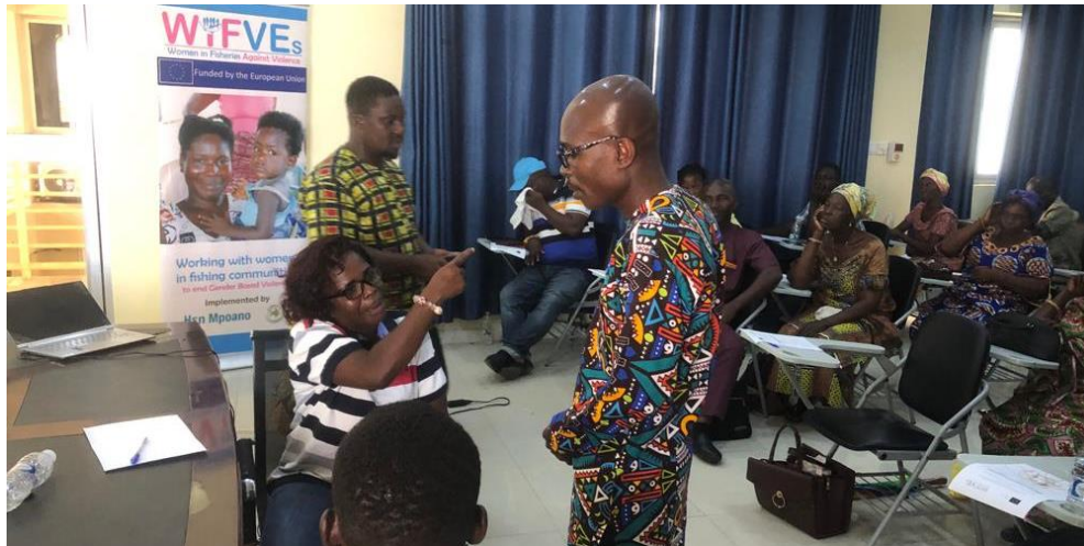
Figure 5: Participants engaged in role play

It was also recommended that the Project advocate for the development and implementation of strong laws and policies that address GBV, protect victims, and hold perpetrators accountable. The project could also contribute to ensuring access to justice for survivors of GBV by improving legal aid services and training law enforcement personnel on GBV issues.